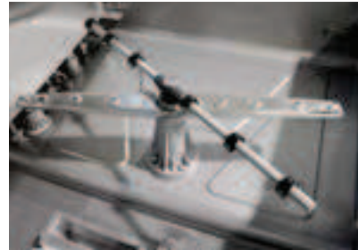
Lower washing and rinsing arms + stainless steel filters